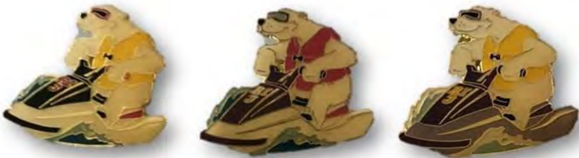
POLAR BEARS - NUMBERED