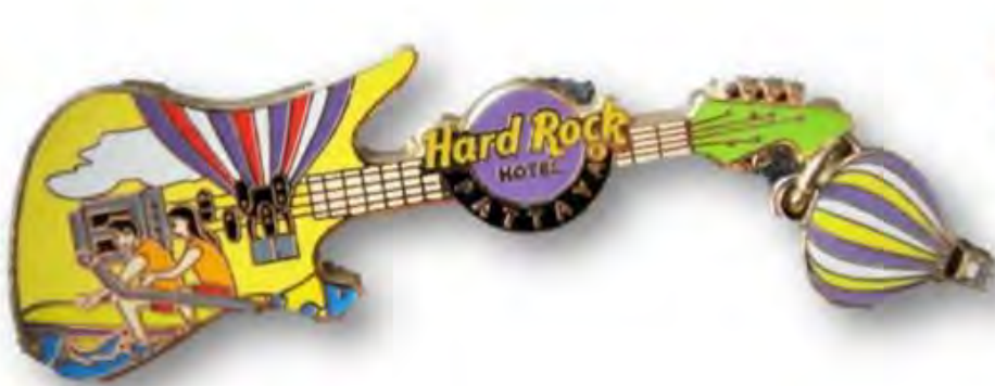
Hard Rock Cafe Pattaya Hotel Jet Ski & Hot Air Balloon Dangle Guitar Pin 2015