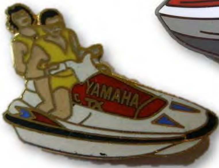
Yamaha WaveRunner® III