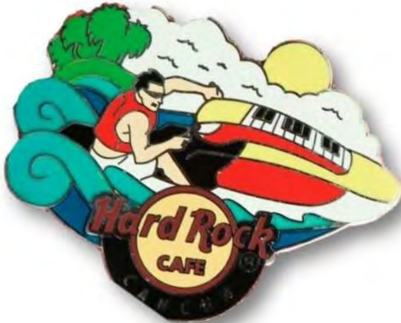
Hard Rock Café Cancun Mexico