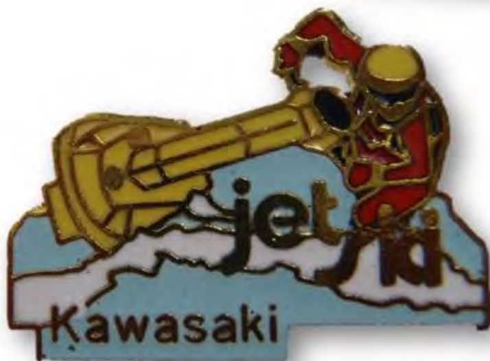
Kawasaki Jet Ski® Stand Up Leg Drag