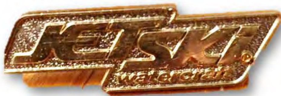
Kawasaki Jet Ski®