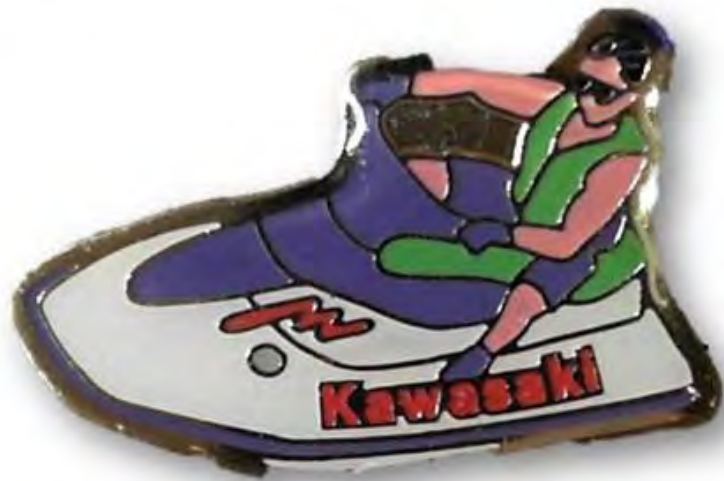
Kawasaki Jet Ski