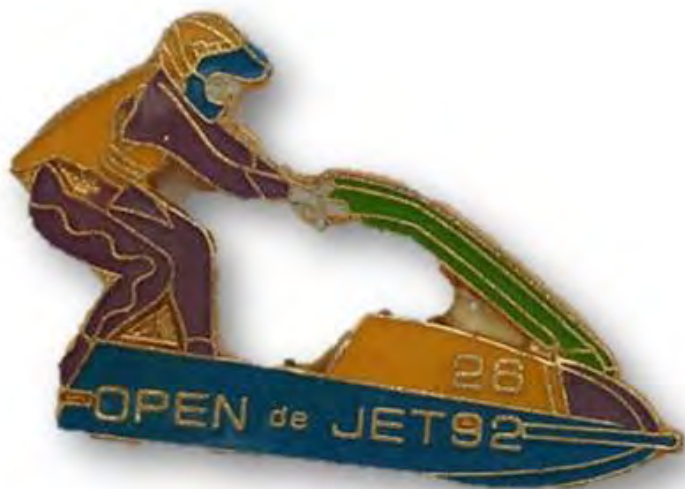
1992 Open de Jet #26