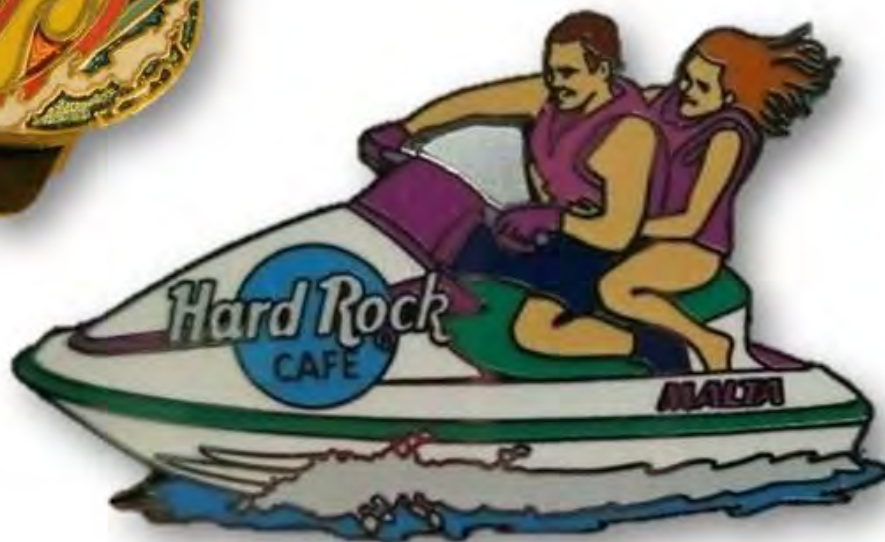
Hard Rock Cafe Pin Malta