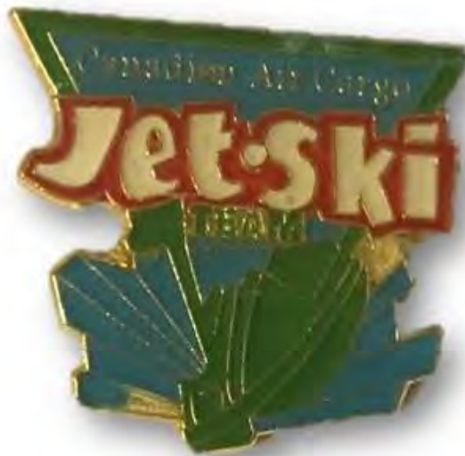
JET SKI TEAM Canadian Air Cargo