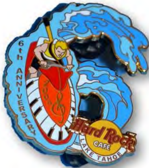
HARD ROCK CAFE 2004 Lake Tahoe 6th Anniversary Guy on Jet Ski Pin