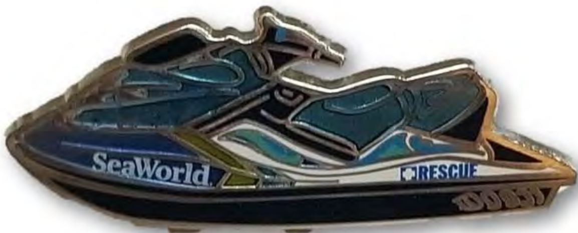
SeaWorld® Rescue Boat Jet Ski