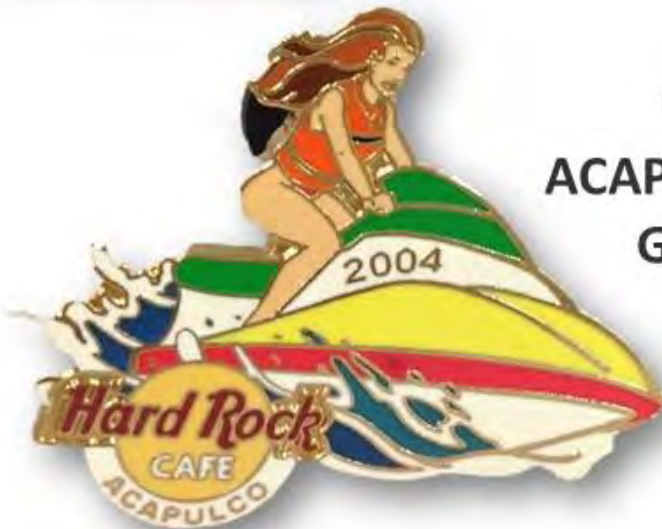
Hard Rock Cafe ACAPULCO 2004 Summer Girl Riding Jet-Ski