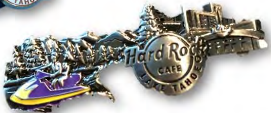
Hard Rock Cafe *LAKE TAHOE* CLOSED..SKYLINE JET SKI 3D GUITAR PIN