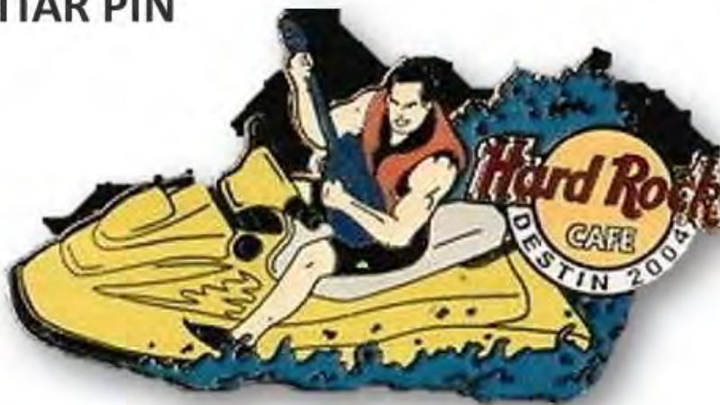
Hard Rock Cafe DESTIN 2004 Man Riding JET SKI Playing Guitar PIN