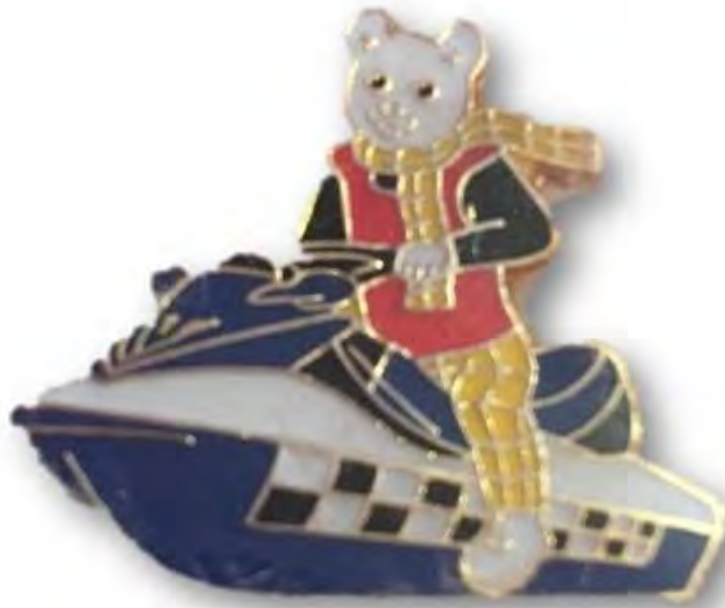
Rupert Bear On Jet Ski