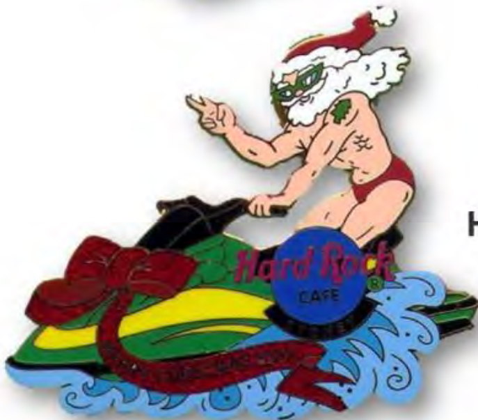
Hard Rock Cafe SYDNEY 2001 CHRISTMAS PIN SANTA Riding Jet-Ski